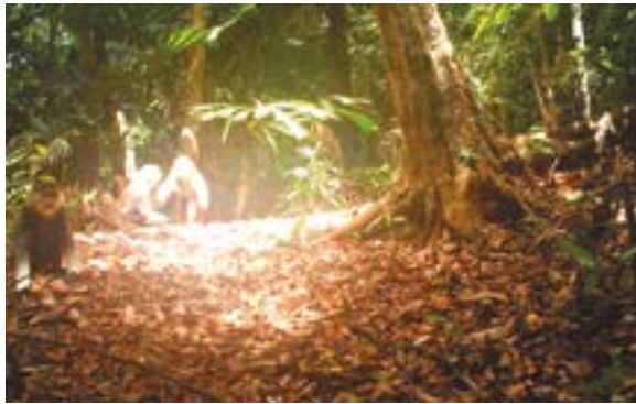
Fig.5. Camera trap photo shows three juvenile red-shanked douc langurs playing on the ground.

P. nemaesus is generally considered an arboreal species, but it has been already reported that individuals occasionally descend to the ground (Vu Ngoc Thanh et al. 2008; Timmins & Duckworth 1999). Our camera trap photos confirm terrestrial behavior of douc langurs. We suspect that douc langurs spend more time on the ground when undisturbed. However they might be forced to travel on the ground in disturbed habitats with forest and canopy gaps.