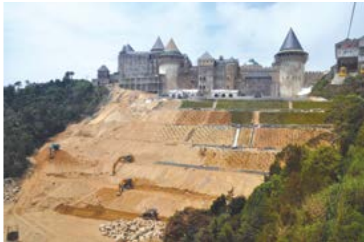
Fig.3. Mountain top in Ba Na-Nui Chua Nature Reserve in 2012 during the conversion in a Mega-Tourist Amusement Park.

Selective logging occurred in the Annamite Mountains in the early 1900's, and the habitat suffered further devastation during the Vietnam War. Consequently the forests at all elevations in BNNC have been impacted. Previous clearings support only secondary growth, which varies in vegetation structure and composition depending on the time that has elapsed since the disturbance. The original parcel of BNNC has been opened for tourism in 2002 and in the past 15 years habitat disturbance has increased dramatically, especially on Ba Na Mountain where a major tourism development transformed the forest area into a resort and amusement park, which included the installation of a 5.8 km long cable car system. The area is a very popular tourist destination and averaging 5000 visitors daily, the number of visitors to Ba Na Mountain surpassed 1.5 million in 2015 (Data: Ba Na Cable Car Co., Ltd) (Fig. 3).