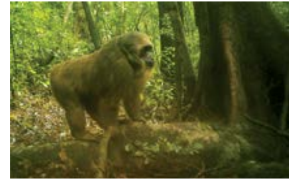
Fig.6. Camera trap shot a stump-tailed macaque ( Macaca arctoides ).

Interestingly only M. leonina treated the novel object "camera trap" as a potential threat e.g. by showing aggressive facial expressions and body posture. This species might be more protective and might defend its home range from perceived intruders.