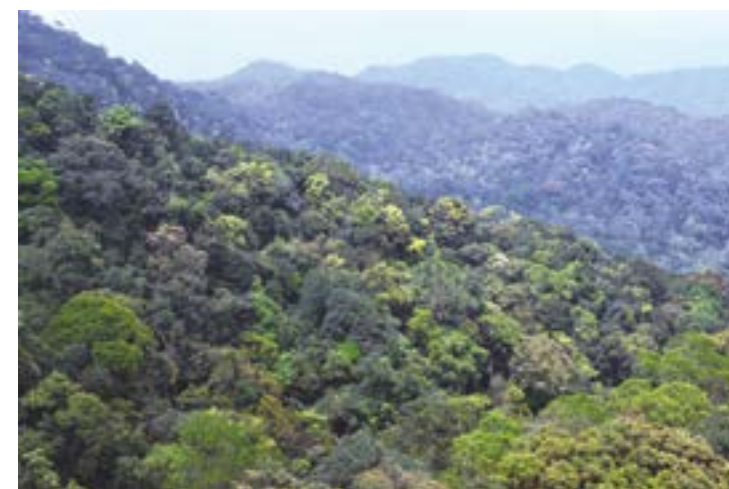
Fig.2. Lower montane evergreen forest at Ba Na-Nui Chua Nature Reserve. Photo: T. Nadler.

The main vegetation types at BNNC are lowland evergreen forest (<1,300 m asl) and lower montane evergreen forest (>1,300 m asl) (Fig. 2). Dipterocarpaceae dominate the lowland evergreen forest, but are absent in the lower montane evergreen forest, which is characterized by Fagaceae, Lauraceae and Podocarpaceae (Hill et al. 1996).