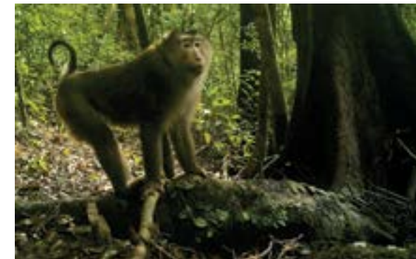
Fig.7. Camera trap shot a northern-pig-tailed macaque ( Macaca leonina ).